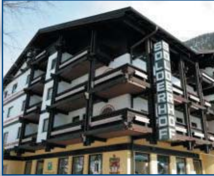
Hotel Sölderhof, Sölden