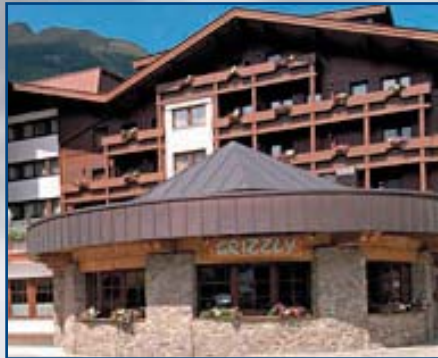
Hotel Tyrolerhof, Sölden