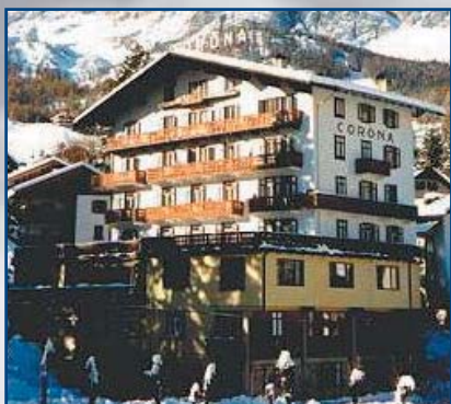
Hotel Corona, Cortina