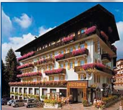
Hotel Victoria Park, Cortina